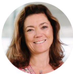
KRISTIN SKOGEN LUND CEO

Schibsted ended 2020 with a strong fourth quarter, continuing the recovery after the contraction in the start of the COVID-19 pandemic. Driven by underlying 1 revenue growth of 4 percent and cost savings, we achieved a strong EBITDA of NOK 665 million in Q4, increasing by 45 percent compared to the same period last year.